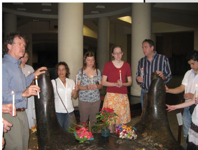
Romero House delegation at Romero's tomb